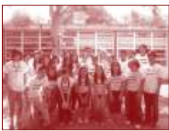
Our Government Team is one of 8 Competitive Academic Teams.