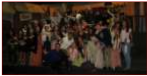
All the World is a Stage for our Drama Production